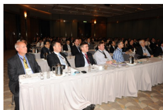
Integrate 2010, 2-3 June 2010

Continues with the successful IFMA's World Workplace Asia 2011 – Conference & Expo attracted over 500 FM professionals from Asia Pacific region, our next annual conference Integrate 2012 will be held on 5-6 June 2012, collocating with Build4Asia in Hong Kong Convention &