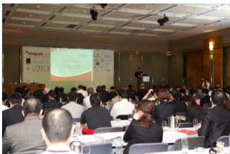
N201B, Hong Kong Convention & Exhibition Centre