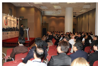
World Workplace Asia 2011